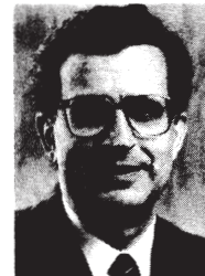
Paul Tagliabue Commissioner National Football League

"The National Federation is very proud to be associated with the 'Be A Sport' program, which links the high schools of America with collegiate and professional programs in an effort to encourage one of the most important responsibilities to be learned from participation in sports. The observation of Plato that one can 'learn more about a person in an hour of play than in a year of conversation,' illustrates the ability of our events to develop that aspect of sport that contributes to the development of young people. We are obligated at every level to promote the concept of sportsmanship in order to support our nation's ideals of good citizenship. Good sportsmanship is good citizenship — we need to always keep that goal before us."