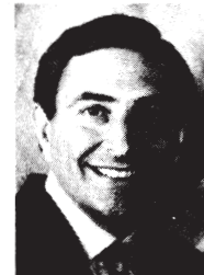
Gary B. Bettman Commissioner National Hockey League

"We encourage our players and teams to strive to be the best. A big part of that commitment is recognizing the importance of sportsmanship. To be the best, you have to be a good sport. What is sportsmanship? It's just what the dictionary says: 'a person who can take loss or defeat without complaint, or victory without gloating, and who treats his or her opponents with fairness, generosity and courtesy.' The NFL is pleased to be part of this effort to celebrate and promote sportsmanship."