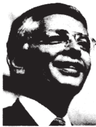
David J. Stern Commissioner National Basketball Association

"The NAIA is glad to be a part of the effort to promote sportsmanship for amateur and professional athletics. We see this partnership with other amateur and professional sports organizations as a collective approach that will improve sportsmanship in athletics. We join with others in encouraging coaches to be cognizant of their responsibility as leaders in developing sportsmanship. By doing so, it is clear that their athletes will respond positively.