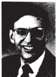
Bud Selig Chairman Executive Council Major League Baseball

Following are quotes from the leaders of the eight members of the National Sportsmanship Committee regarding the importance of sportsmanship, especially relating to conduct of players and coaches: